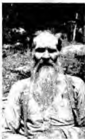
(2) MILLER COFFEY the singer of Stole, Stole